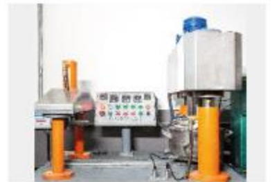
▲ SMALL HIGH SPEED DISPERSION TESTING MACHINE