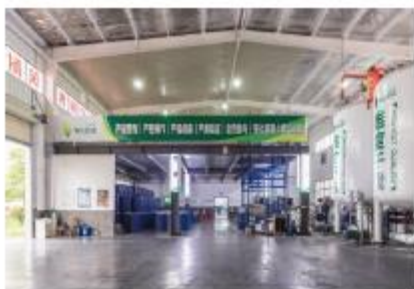
▲ PRODUCTION AREA