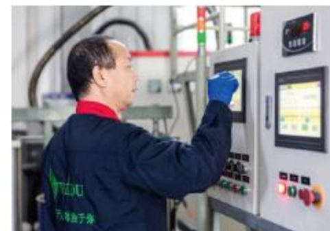
▲ PLC CONSOLE