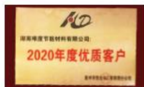
▲ Annual Quality Customers