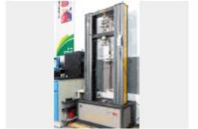
▲ DOUBLE MODULE TENSILE TESTING MACHINE