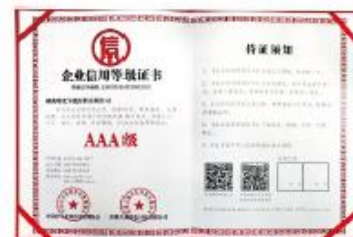
▲ AAA Credit Enterprise