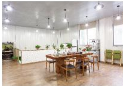
▲ NEGOTIATION AREA