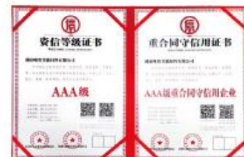
▲ AAA Grade Contract Abiding And Trustworthy Enterprise