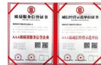
▲ AAA Credit Management Demonstration Unit