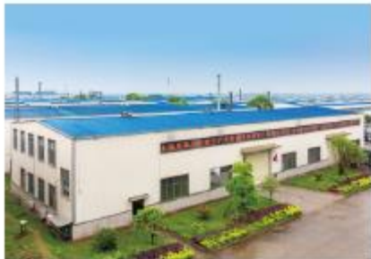
▲ EXTERIOR VIEW OF THE PLANT