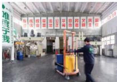
▲ EQUIPMENT AREA