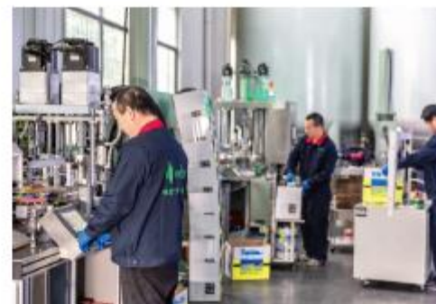
▲ SINGLE-COMPONENT AUTOMATIC PRODUCTION LINE