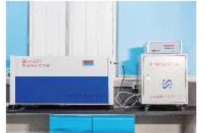
▲ SEALANT COMPATIBILITY TEST CHAMBER ▲ WATER-ULTRAVIOLET IRRADIATION TEST CHAMBER