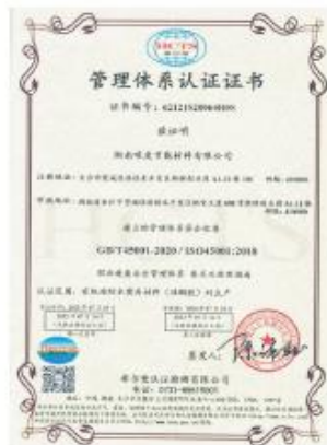
▲ ISO 45001:2018