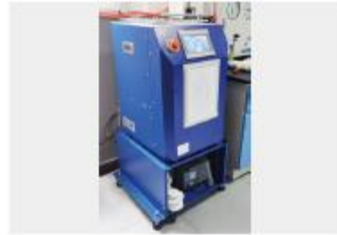
▲ SPEED MIXER