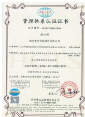
▲ ISO 14001:2015