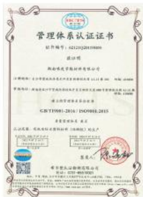
▲ ISO 9001:2015