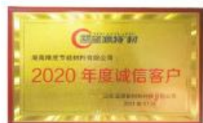
▲ Annual Honest Customer