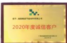
▲ Annual Honest Customer