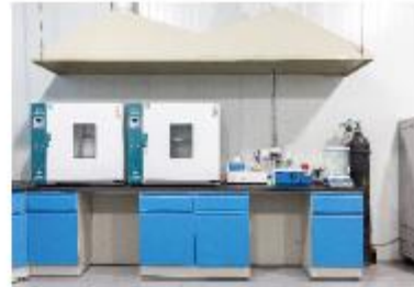
▲ SAMPLE MAINTENANCE EQUIPMENT GROUP