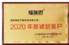
▲ Annual Honest Customer