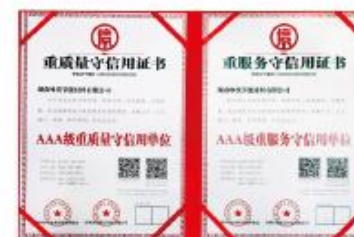
▲ AAA Grade Service And Trustworthy Unit