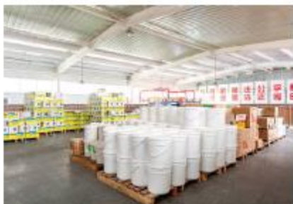
▲ INVENTORY AREA